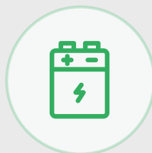
Lead-acid/ Lithium Battery