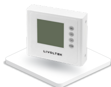
Optical LCD Screen