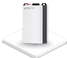
Residential Lithium Battery